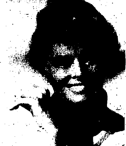
KATHARINE HEPPURN continues through July in Coco, hit musical at the Mark Hallinger Theatre, New York. The show plays through July 4 through Saturday nights with new songs on Wednesday and Saturday plus an additional mid-week matinee on Thursday in an accommodate weekly shoppers and visitors to the city.