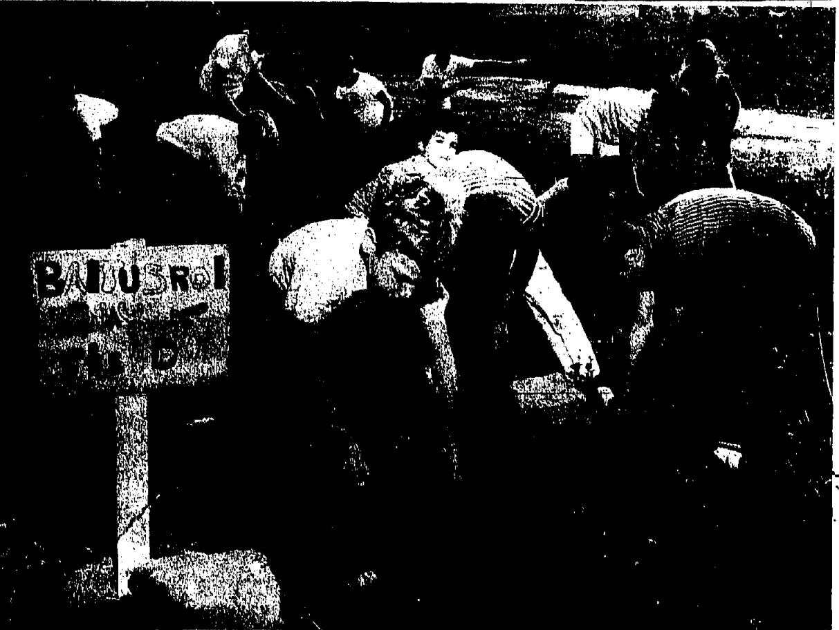
TIME TO PLAY BALL , ALMOST — Youngsters from the Balmoral way-Bryant avenue area in Springfield are busily clearing the vacant lot at the intersection of these streets. The land is part of the Rt.