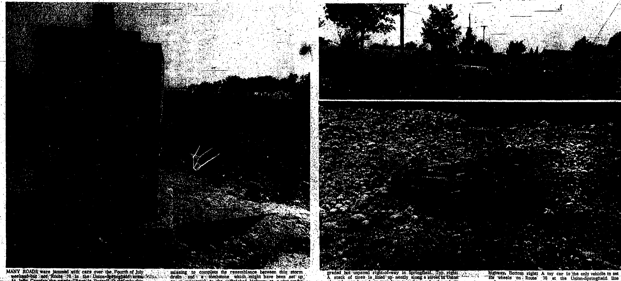
MANY ROADS were jammed with cars over the Fourth of July weekend. The highway shown here is one that doesn't have holiday traffic tie-ups.