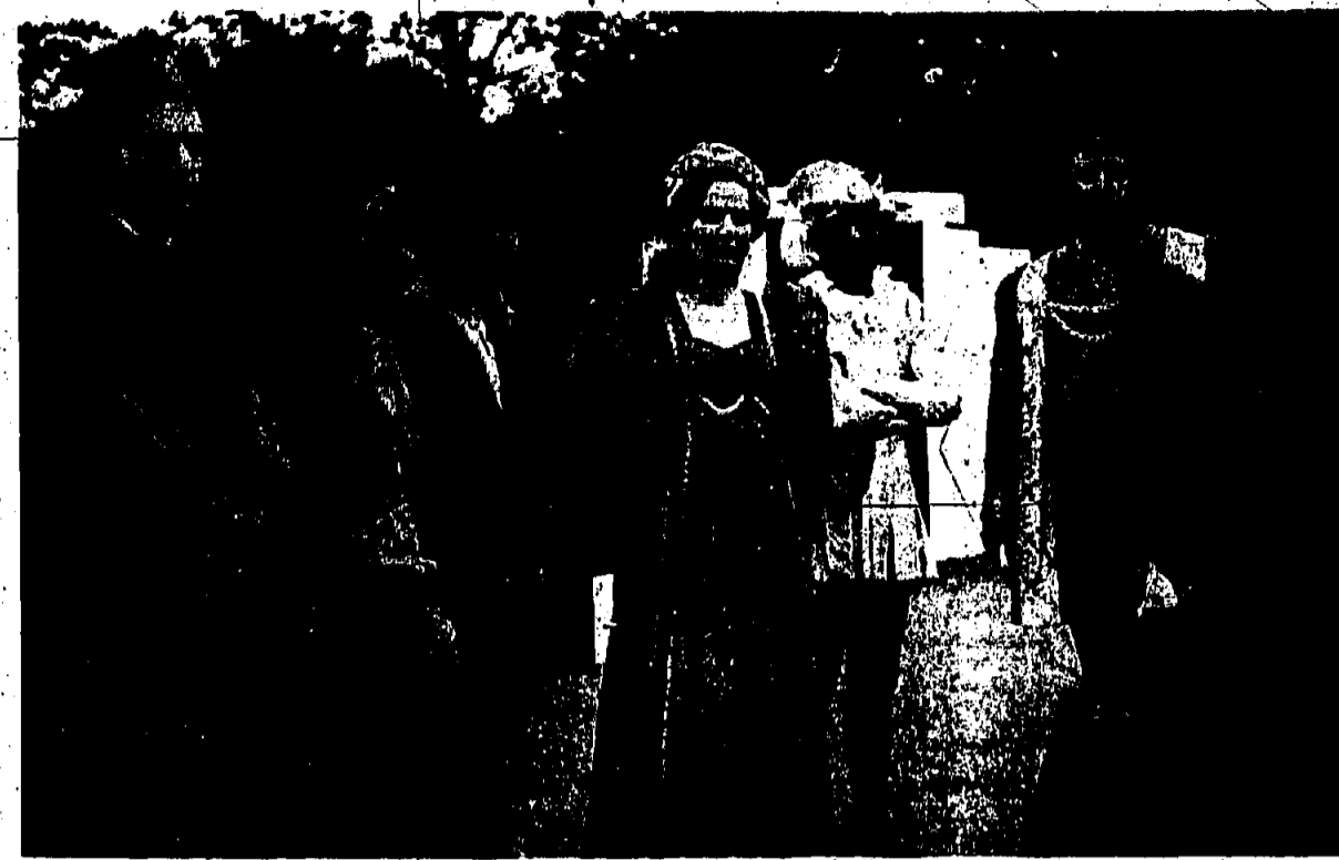
TAME IS THE GAME — All the world's a stage, including Echo Lake Park, and the New Jersey Shakespeare Festival of Woodbridge.