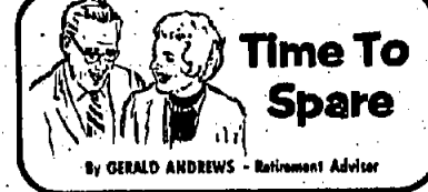
Time To Spare