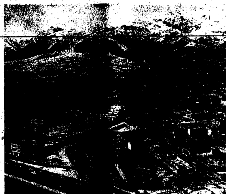
THE ALBORZ MOUNTAINS as they look from the city of Tehran. On the right near the top of the picture is the site of the Shah's residence...