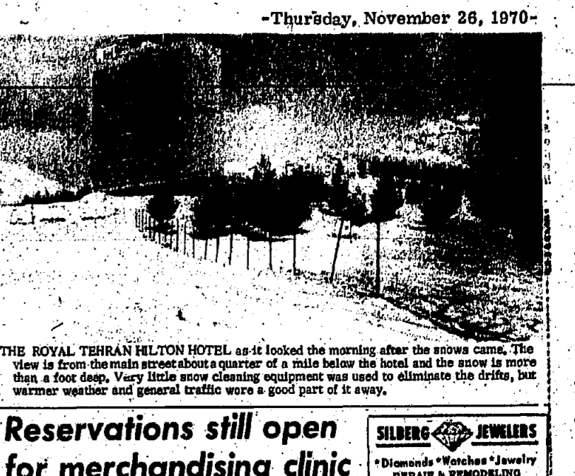
THE ROYAL TEHRAN HILTON HOTEL as it looked the morning after the snow came. The view is from the main entrance...