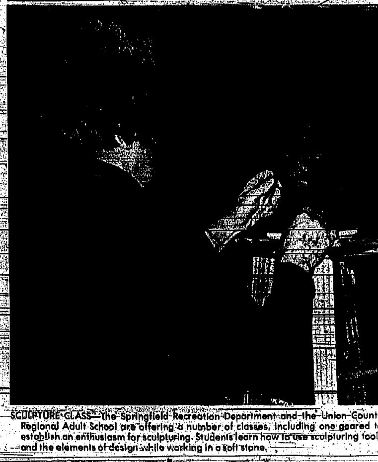
SCULPTURE CLASS — The Springfield Recreation Department and the Union County Regional Adult School are offering a number of classes, including one geared to establish an enthusiasm for sculpturing. Students learn how to use sculpturing tools and the elements of design while working in a toll-free studio.