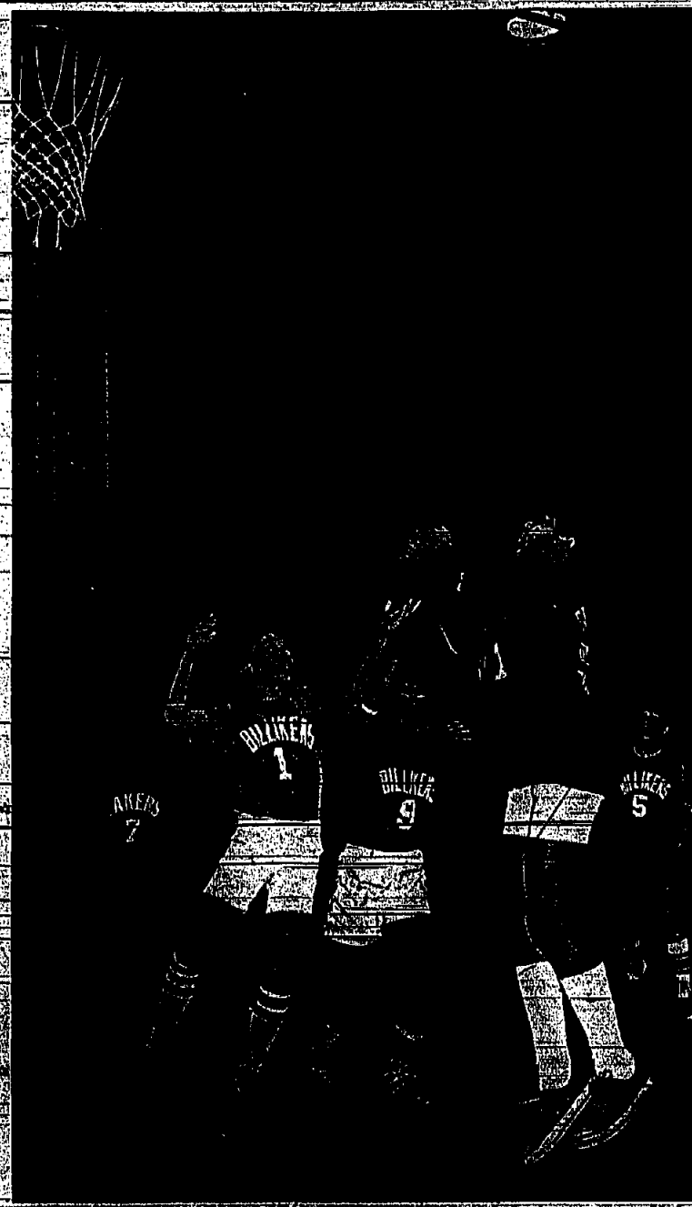
TAKING AIM — Jump shot is part of the action in the Small Fry League for fourth and fifth graders at the James C. Caldwell School. First of the three leagues operated for local youngsters by the Springfield Recreation Department.

VOL. 47 NO. 17 SPRINGFIELD, N.J., THURSDAY, JANUARY 22, 1976. PUBLISHED BY YOUNG PUBLISHING CORP. 41 NEWTON AVE., SPRINGFIELD, N.J. 07081 - 684-7700. PUBLISHED BY YOUNG PUBLISHING CORP. 41 NEWTON AVE., SPRINGFIELD, N.J. 07081 - 684-7700. PUBLISHED BY YOUNG PUBLISHING CORP. 41 NEWTON AVE., SPRINGFIELD, N.J. 07081 - 684-7700.