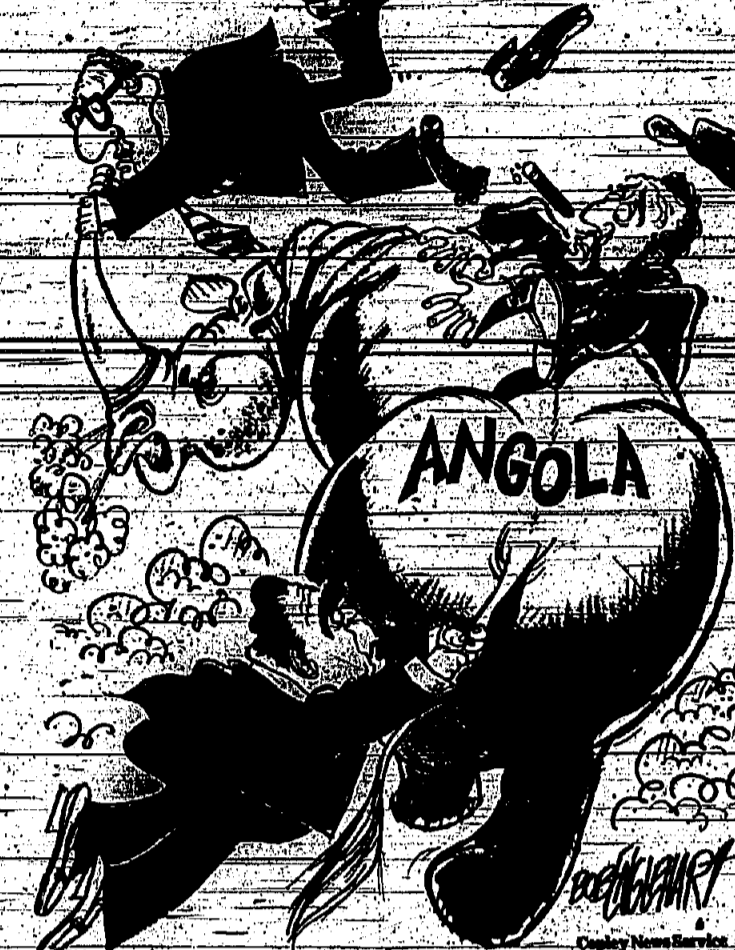
When I say three, we all get one... two... two and a half... two and three fourths... two and...