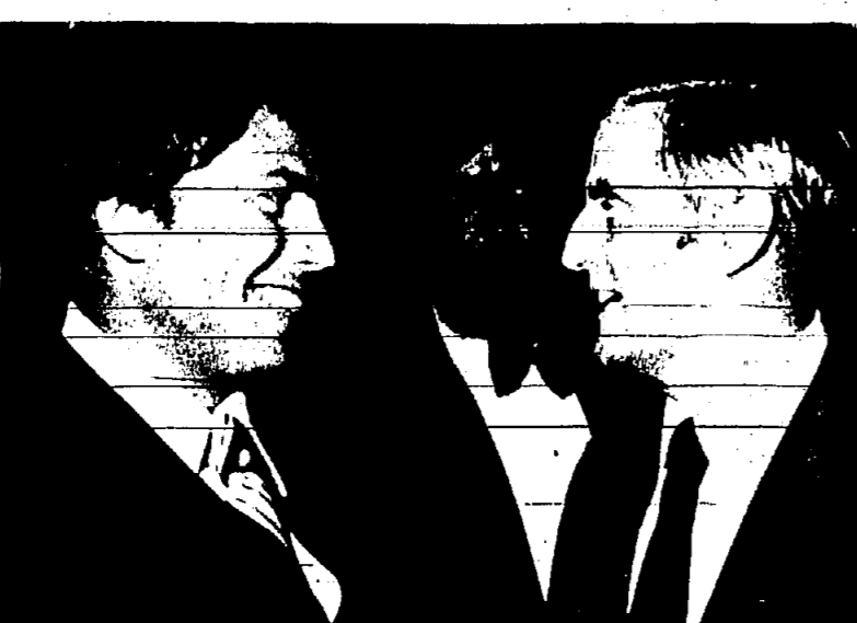
CANDIDATES MEET—Sen. Walter F. Mondale, (right) Democratic vice-presidential candidate...