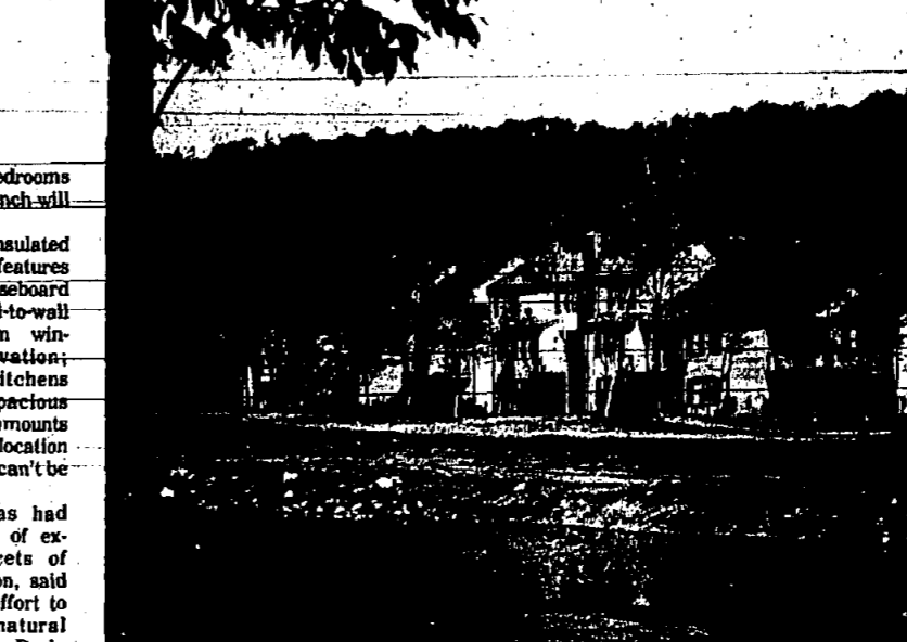
RURAL SETTING... (text continues)

RECREATION AREA IS SOCIAL CENTER AT LAUREL BROOK