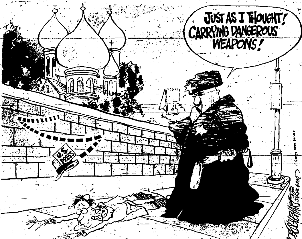
JUST AS I THOUGHT! CARRYING DANGEROUS WEAPONS!