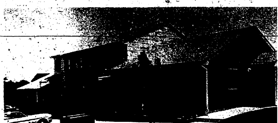
WIDDEN COMMUNITY —The attached homes at Barneget Woods in Barneget, offer good living at extremely low cost. Two-bedroom ranch in photo at end, is priced at $149,000. The three-bedroom townhouse, center, is only $95,000. All homes are spacious fully sodded back yards, landscaping and private parking at the front. Barneget Woods is not a condominium; there are no monthly maintenance fees.