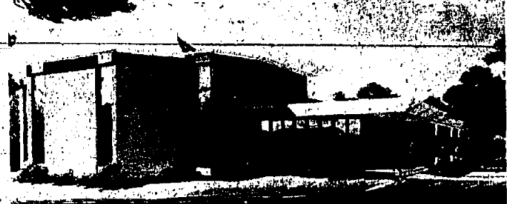
CORNERSTONE CEREMONY—Congregation Israel's new synagogue center and religious school, shown in rendering by architect Abe Goodman, will have its cornerstone ceremony Sunday, Sept. 24.

The Springfield First Aid Squad, a volunteer rescue organization, reports handling the following calls during the week ending last Saturday: SEPT. 7 12:40 p.m.—Man, complaining of abdominal pains, taken to St. Barnabas Medical Center. 8:30 p.m.—Man fell, possibly fractured his hip. SEPT. 8 7:30 a.m.—Woman who fainted taken to Overlook Hospital with assistance from Medic II team. 8:50 p.m.—Ambulance requested, then request cancelled. SEPT. 9 2:35 p.m.—Man taken to Overlook Hospital after a fall. 11 p.m.—Person transported to Marlboro Psychiatric Hospital in Red Bank. SEPT. 6 11:34 a.m.—Woman with diabetic reaction taken to Overlook Hospital with Medic II assistance. 1:50 p.m.—Man having repeated seizures taken to Overlook with Medic II assistance. 7:30 p.m.—Motorcycle accident; patient transported to Overlook with Medic II assistance. SEPT. 8 7:45 p.m.—Patient transported to Cornell Nursing Home in Union. SEPT. 9 6:25 a.m.—Man with chest pain and difficulty breathing taken to Overlook with Medic II assistance. 11 a.m. to 2:50 p.m.—Slandby duty at fire market on high school campus. 5:25 p.m.—Woman with abdominal pains taken to Overlook with Medic II assistance. 11:55 p.m.—Man pronounced dead at home by family doctor.