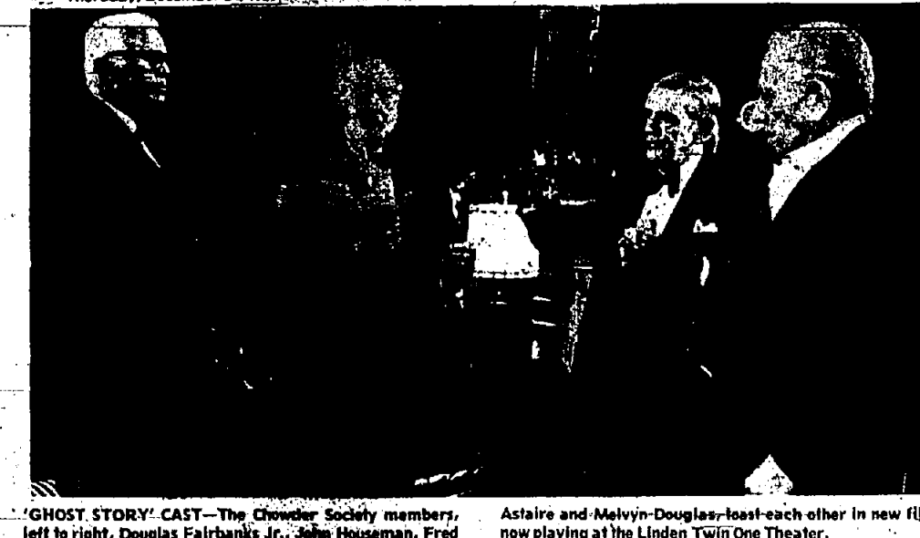
'GHOST STORY' CAST—The Chorus Society members, left to right, Douglas Fairbanks Jr., John Houseman, Fred Astaire and Melvyn Douglas, toast each other in new film now playing at the Linden Twin Theater.