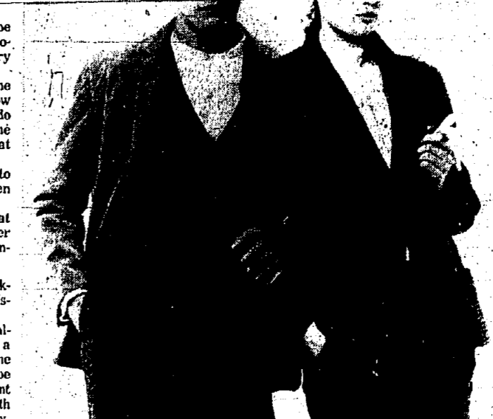
MATCHED IN WOOL—They're in this together: his trousers and her box jacket are moss wool houndstooth tweed; she's wearing her jacket with white handkerchief cotton Victorian collar blouse and moss lamb suede ankle-length trousers.