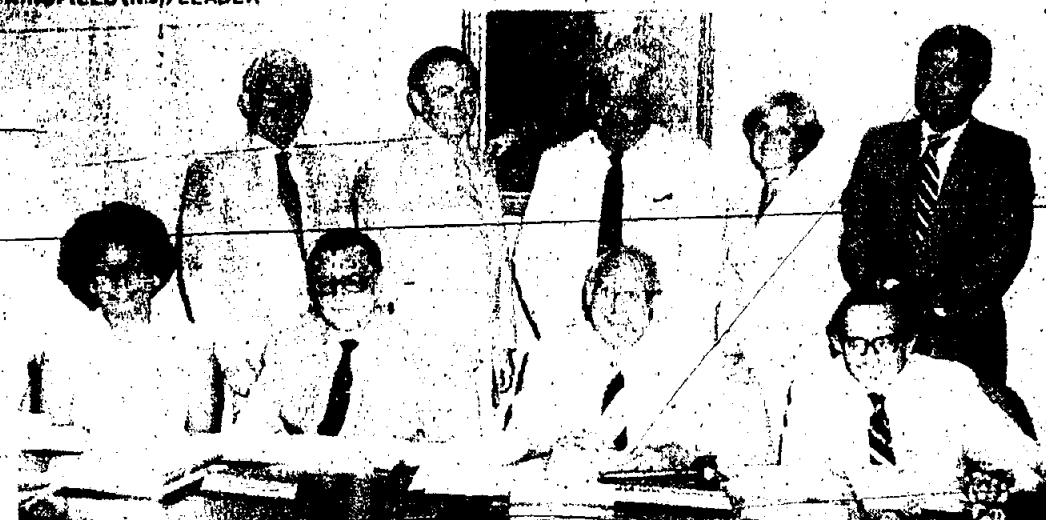
UCC's FOUNDING BOARD—Nine members of the founding board of trustees of Union County College, the newest public university in New Jersey, are shown at the organizational meeting at the main Cranford campus.

The Union County Council on Alcoholism is sponsoring a program to encourage future parents, especially women, to make responsible and informed choices about drinking during pregnancy.