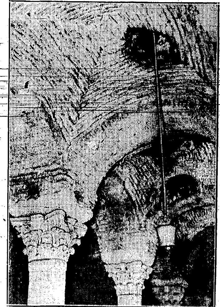
Unique Source of Water Supply

A pull being lowered into the Yere-Batan cistern, which supplies water to more than 600 dwellings in Istanbul, Turkey. Located 140 meters beneath the ground, the great well is supported by over 330 beautiful columns, part of the Christian basilicas destroyed by the Sultan Mohamed.