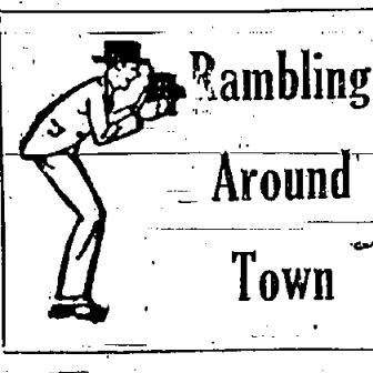
Rambling Around Town