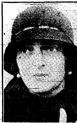
Wins Libel Suit

Princess Irina Youssouppoff, niece of the late Czar of Russia, who was awarded damages of approximately $125,000 in her suit in London against the producers of the film, "Rasputin and the Empress," in which she charged that she was libeled. Princess Youssouppoff, one of the slayers of Rasputin, gave dramatic testimony in the suit.