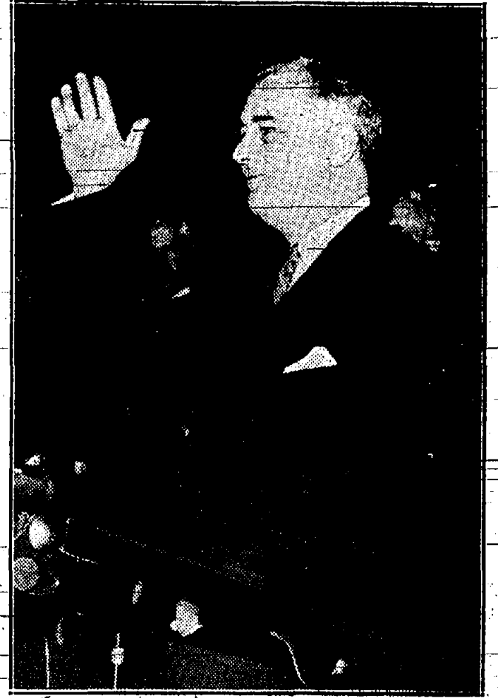
President Addresses NRA Code Meeting

President Roosevelt acknowledging the storm of applause as he rose to address the meeting in Washington of 4,000 members of code authorities assembled to discuss revision of the NRA. He called upon industry further to increase wages and shorten working hours.