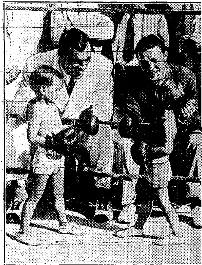
Battle For "High-Chair" Boxing Title