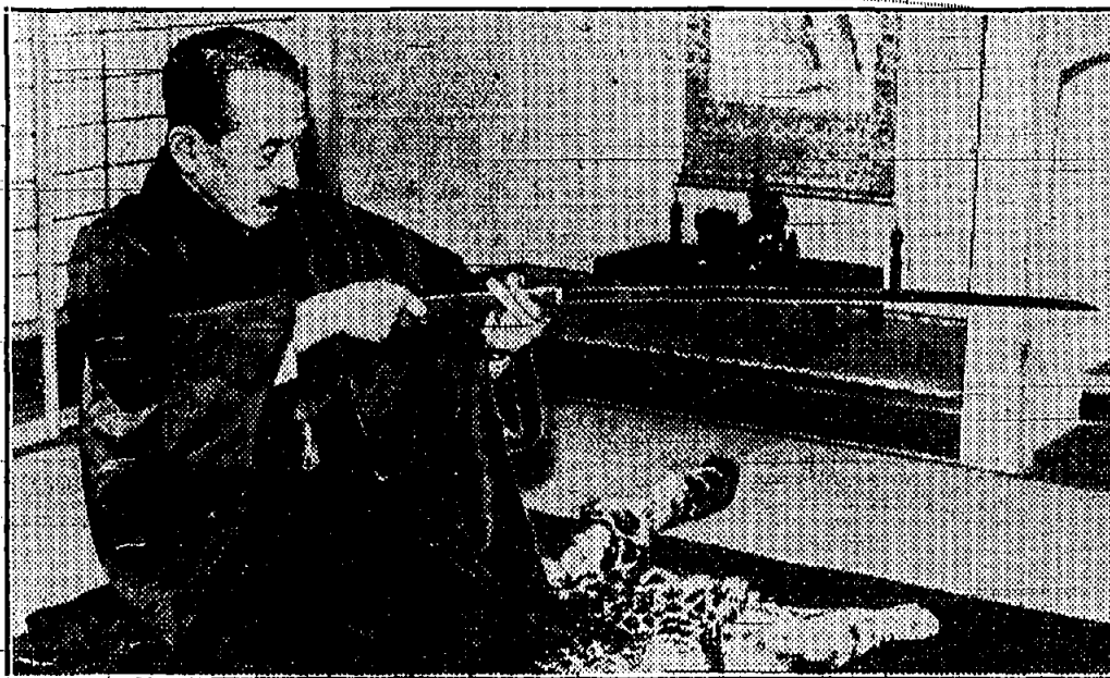
Japan's Minister of Justice a Sword Connoisseur