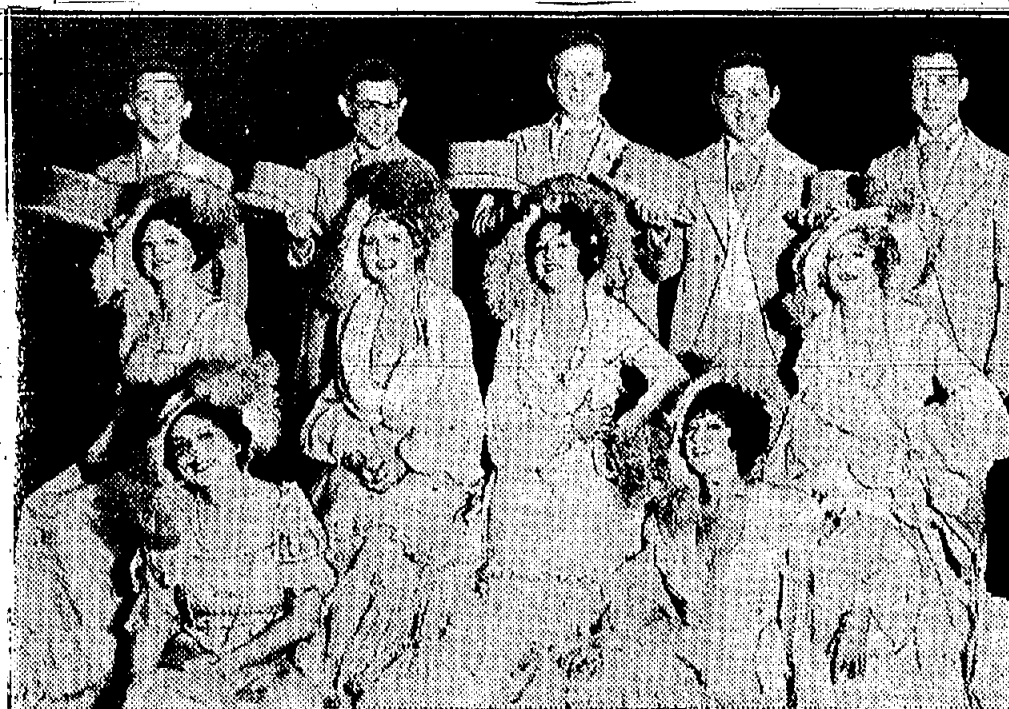
"Floradora Girls" Revive Memories at Palm Beach Fete