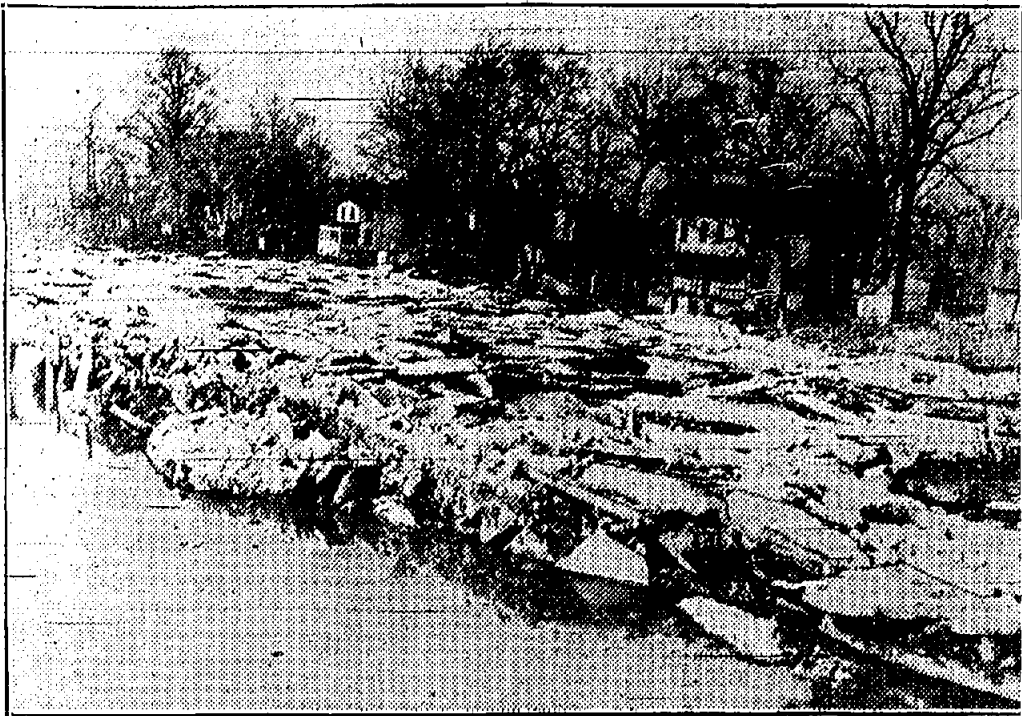
Thaw on Eastern Seaboard Brings Ice Jams and Floods

With premature springlike weather following close on the heels of the recent blizzards and frigid weather in the East, much damage has been done as thawing rivers and streams have overflowed their banks, piling up tons of ice. This picture shows great chunks left in front of homes at Croydon, Pa., when the swollen Neshaminy Creek overflowed.