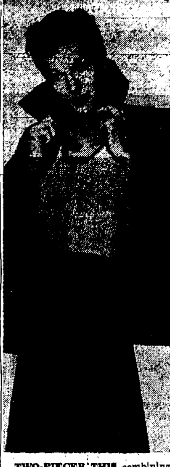
TWO-PIECER, THIS, combining tangerine color skirt and cape with white line crossbars and an attached white bodice, with gilt button fastenings.

Rickets is a condition due to lack of vitamin D, sometimes known as the "sunshine" vitamin. Formed by the body itself in the presence of sunshine, it is essential to strong bones and good general health. Without it, neither calcium nor phosphorus can be used by the body.