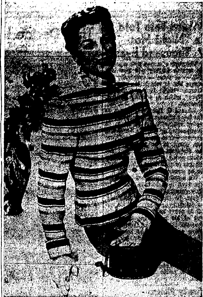
GOLD THAT glimmers in the sunshine at the smart winter resorts . . . a stripe of gold non-tarnishable metallic thread alternates with a marine blue stripe on white wool for the jacket of this suit. Skirt is slim and the blue of the stripe.