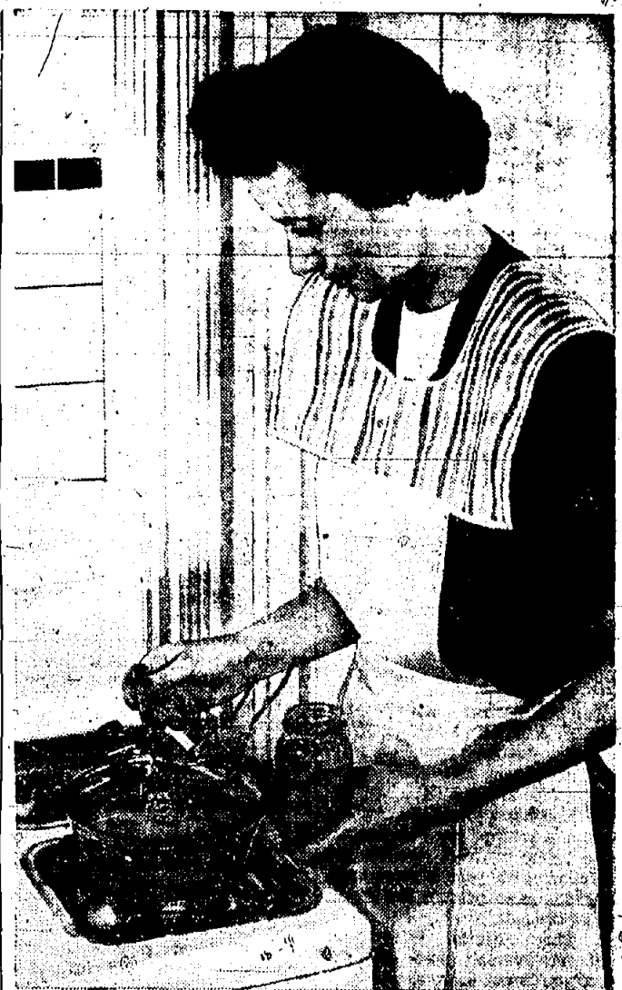
QUICK AS A WINK YOU'LL turn out a Splly Soup Surprise. Mix a can each of tomato and oxtail soup. Add 3 tsp. pickle relish before serving.

Bernardsville Inn U.S. ROUTE 202, BERNARDSVILLE, N. J.