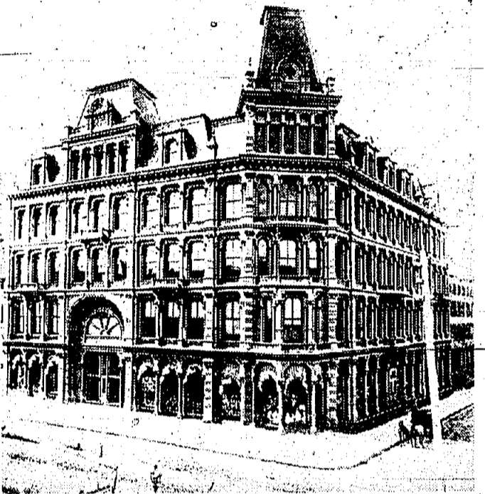
DEPARTMENT STORE INVADES FIFTH AVENUE, were the headlines when Lord & Taylor built this shopping center in New York in 1903.

erected at Broadway and Twelfth street, New York, was the architectural wonder of its day. It was the first iron frame building in New York, had one of the first steam elevators and soon became known as the "Fashion Emporium" of the city.