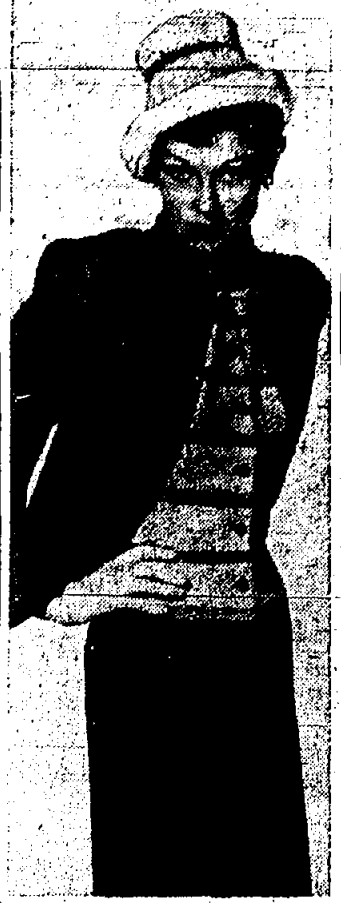
THREE PIECES FOR this knit suit . . . slim heavy skirt, bitter-sweet short jacket, gill-striped white bodice which fits snugly, clings below waist.

The new knit fashions are strikingly good-looking this year, and as you know knits worth mentioning, let alone wearing, behave as smoothly and enduringly as the best woven fabrics.