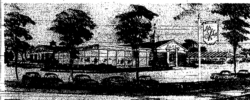
TO BE BUILT IN SPRINGFIELD —Architect's drawing showing new dining place to be constructed at the corner of Morris and Springfield avenues. Deal was closed last week and actual work is scheduled to start very shortly.

Springfield is to have a new dining spot—right at the corner of Morris and Springfield avenues—and, as soon as the present structure occupying the site is either demolished or moved away, the actual construction work is expected to start.