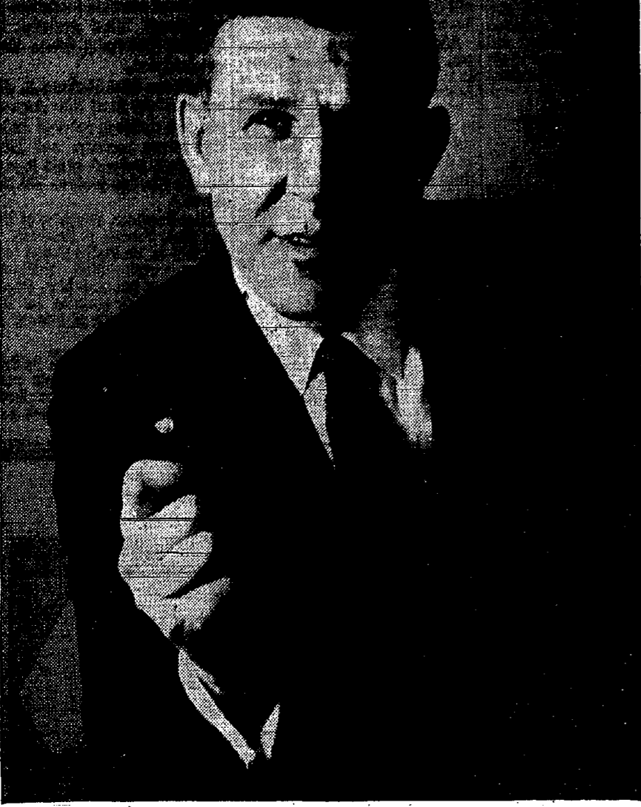
If he'll work, there's faith in his future.